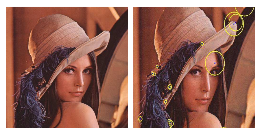
Figure 2: (a) Original Image (b) Selected Regions from Features Detected by the Harris–Laplacian Detector

Here we have used Harris-Laplace detector to detect regions based on corner response. Figure 2 shows the regions detected by Harris-Laplace corner detector.